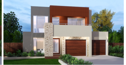
*Illustrations artist's impression only