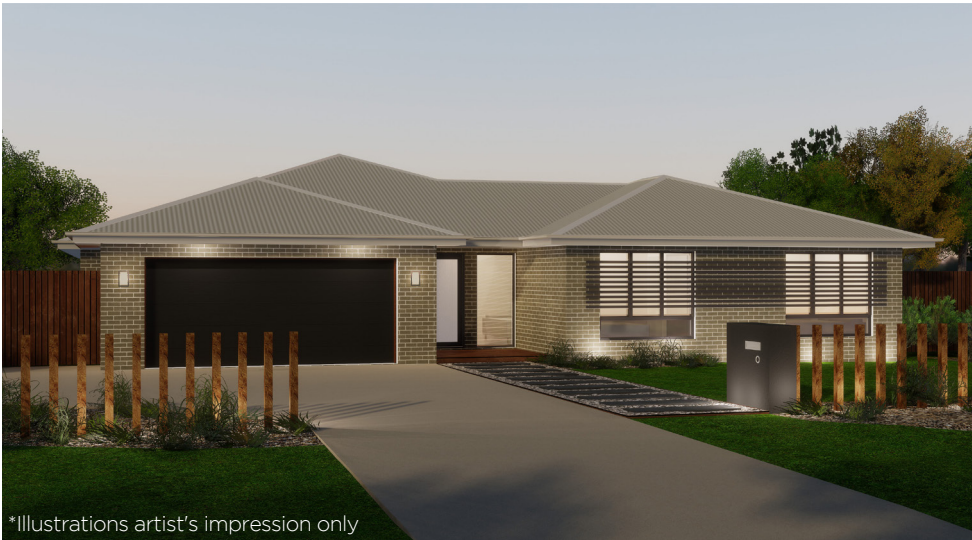
*Illustrations artist's impression only