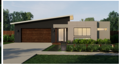
*Illustrations artist's impression only