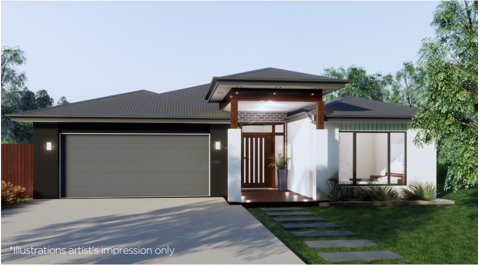
*Illustrations artist's impression only